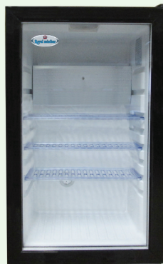
Shown with Glass Door Option

And the world-famous Royal quality and reliability.